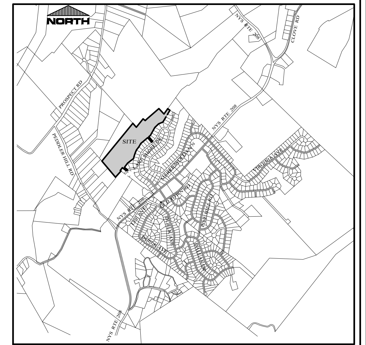
LOCATION MAP SCALE: 1"= 2,000'