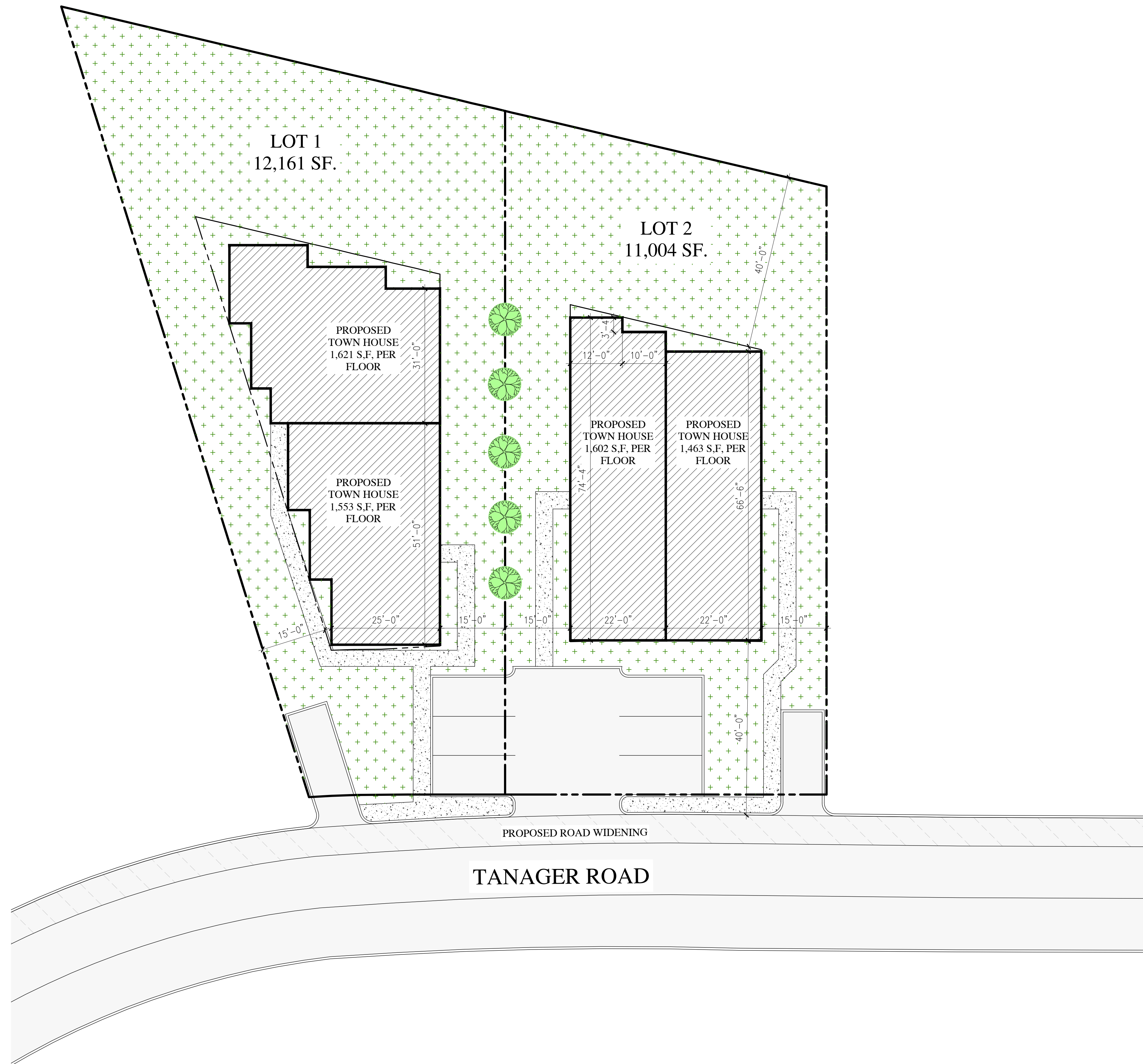
1 SITE SKETCH S-102 SCALE: NTS