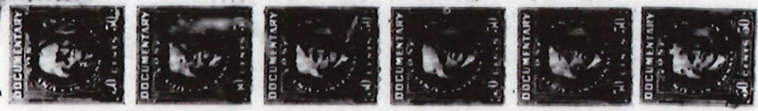
EXHIBIT L 8/18/25 KR