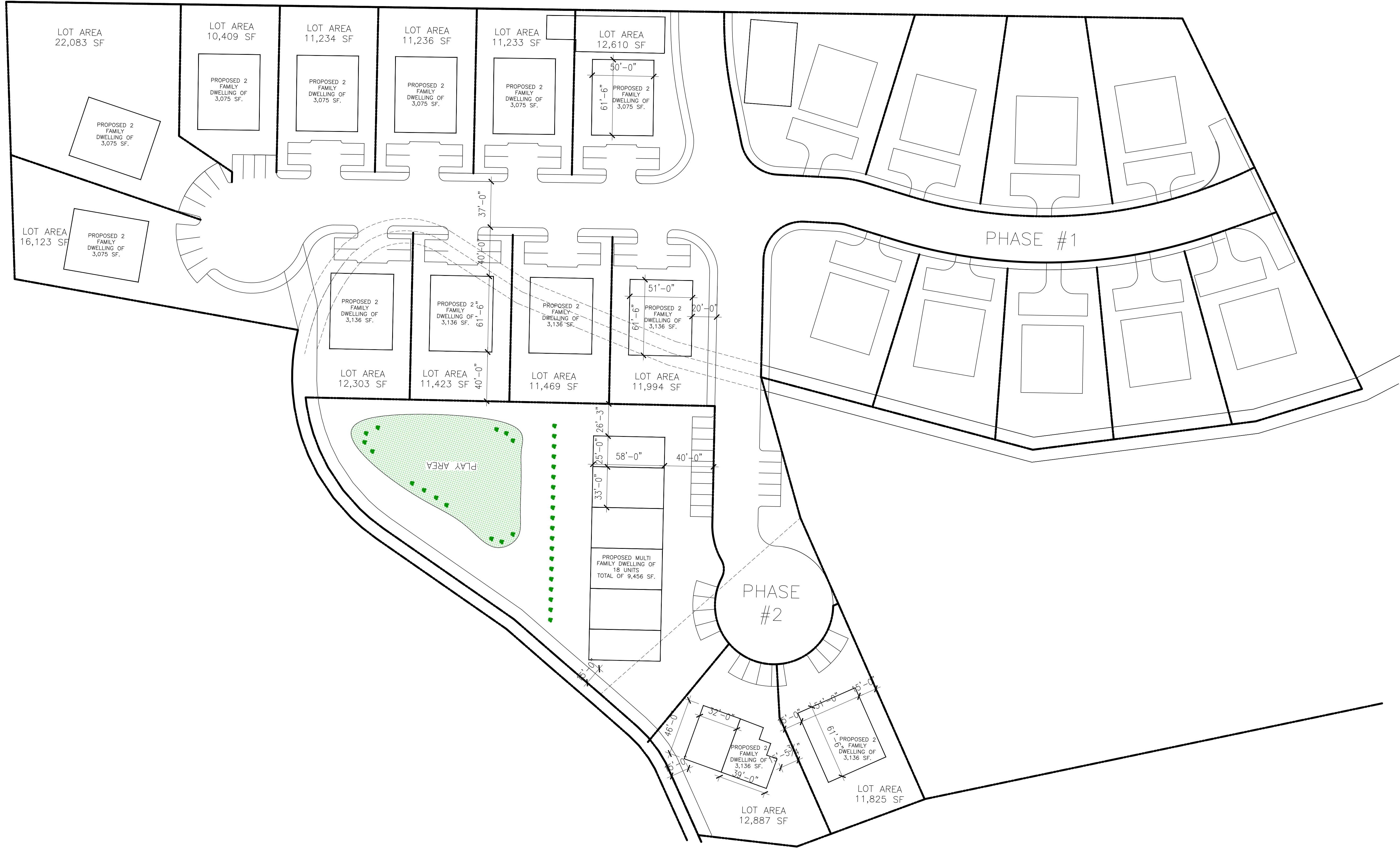
1 SITE SKETCH S-102 SCALE: NTS

Project No. --101 Drawn By: LH Reviewed By: PS Date 9-15-2029