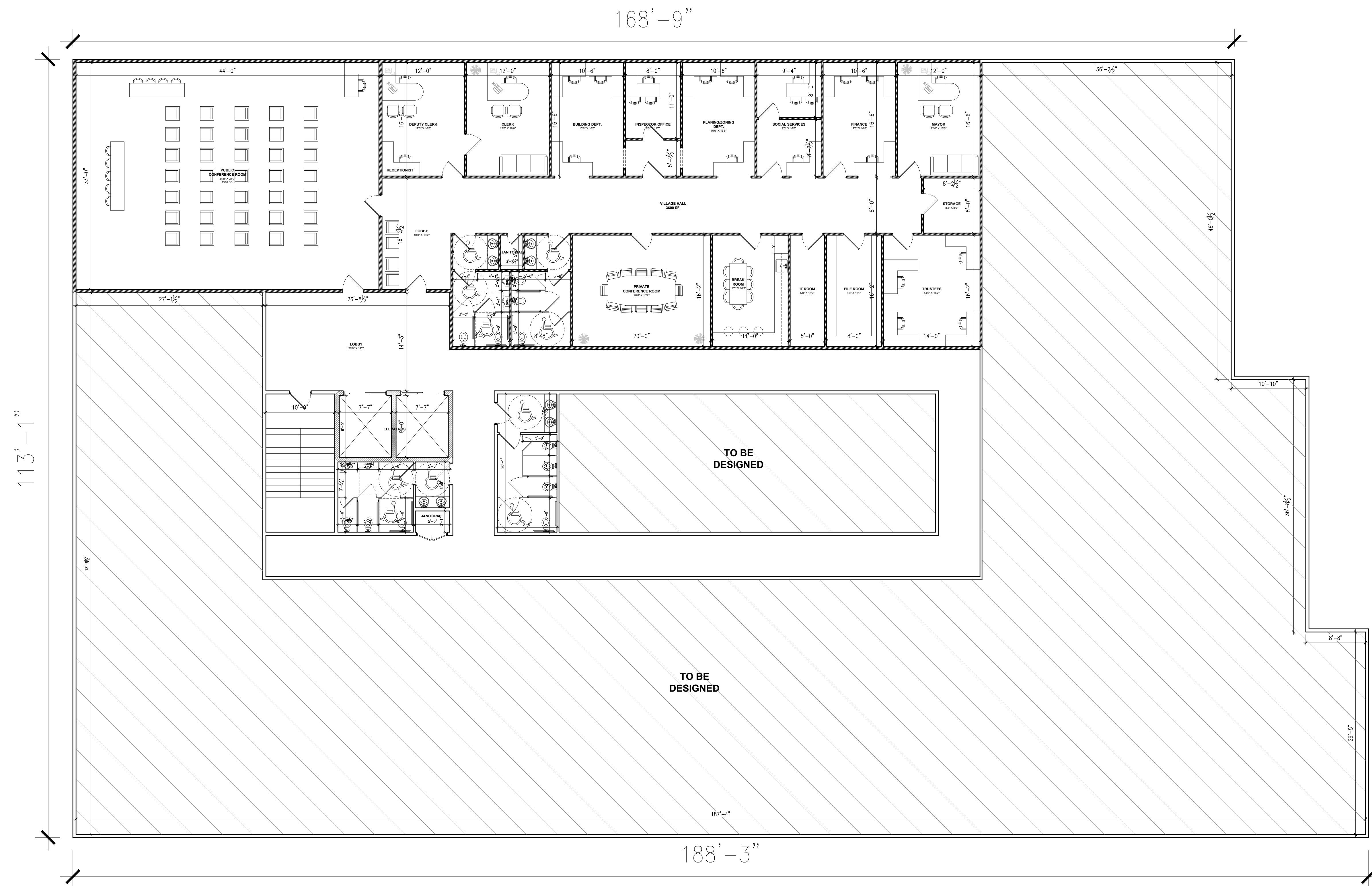
1 FORTH FLOOR PLAN A-102 SCALE: 1/8" = 1'-0"

Project No. ---101 Drawn By: LH Reviewed By: PS Date: JAN. 22, 2025