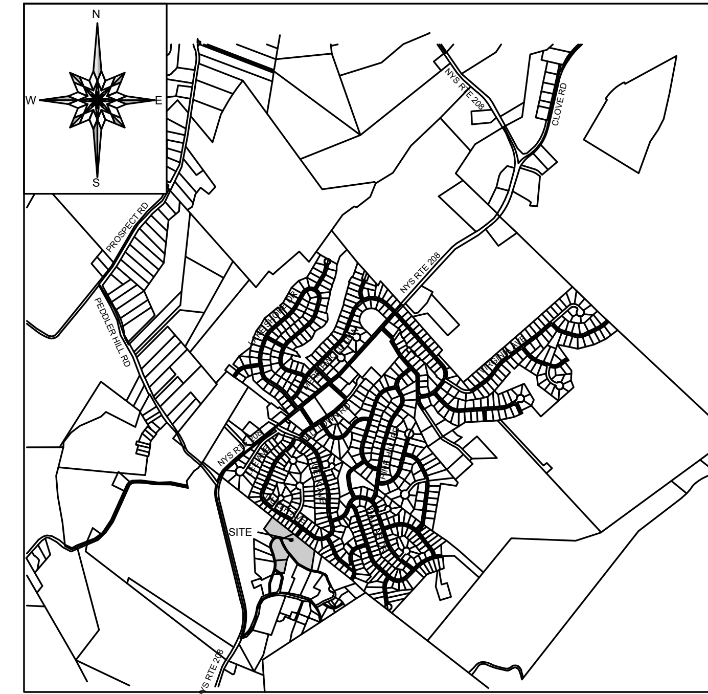
LOCATION MAP SCALE: 1" = 2000'