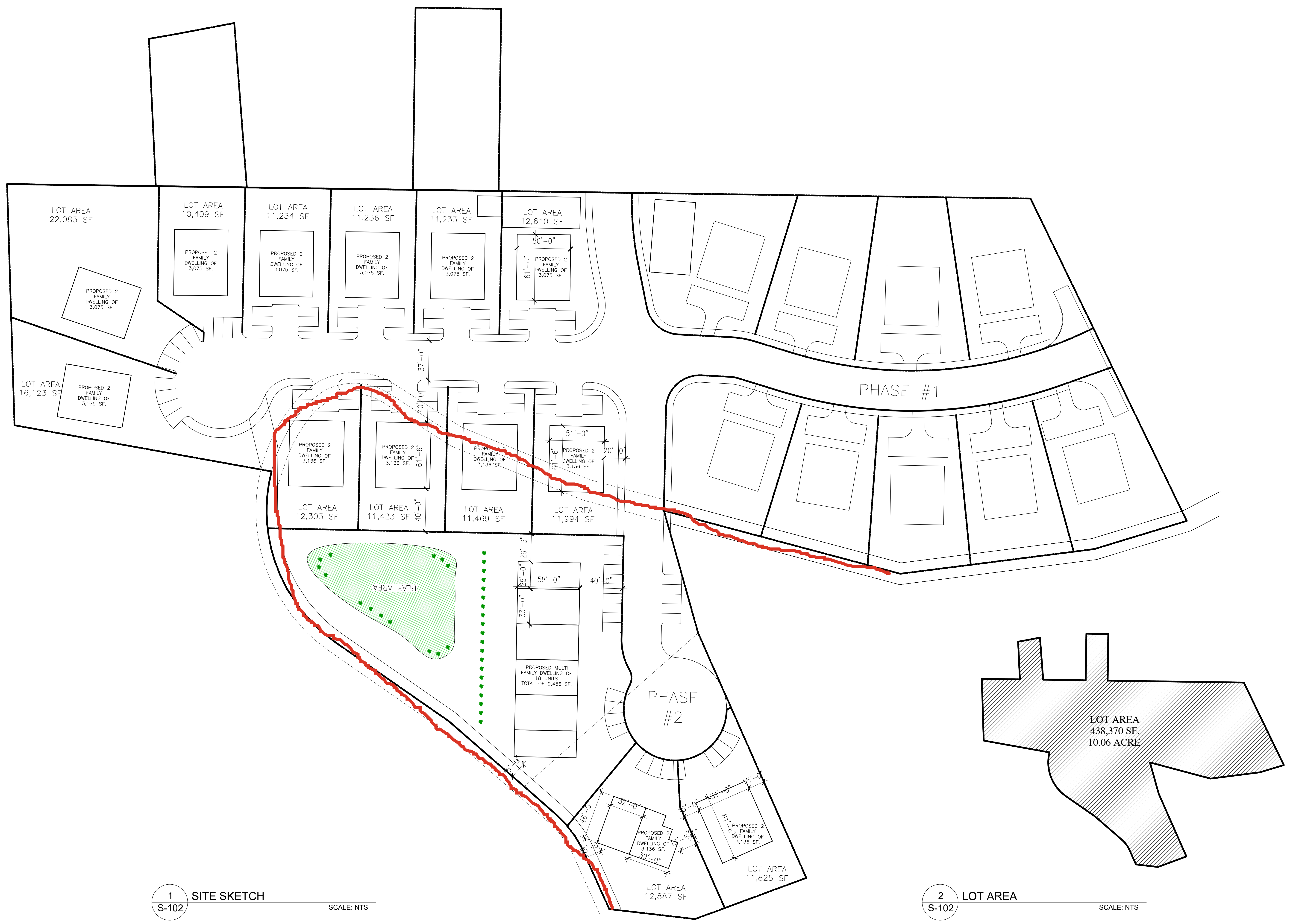
1 SITE SKETCH S-102 SCALE: NTS